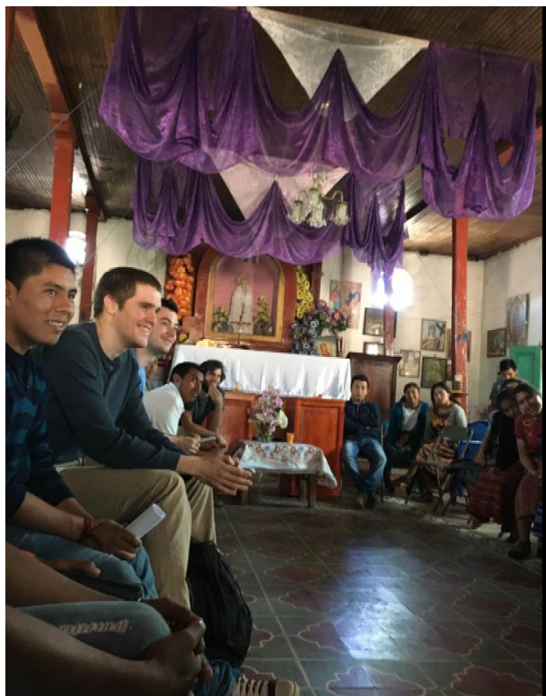
Figure 4: Meeting with a Catholic youth group in Panajxit

When conducting market research in the Quiché region, we visited four schools, Chinique, Panajxit, Chicabracan, and Santo Hermano Pedro. While there, we asked questions to determine the awareness levels of the Barbara Ford Peace Center and the transportation