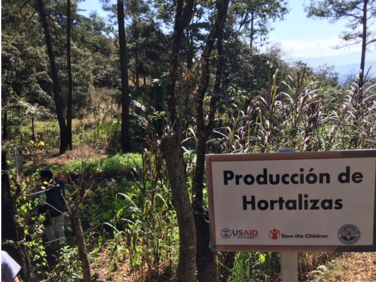
Figure 11: Sustainable Farming area could become a highlight of the trail.

feel comfortable bringing their employees to the BFPC given its location and lack of high accessibility from a major airport. We believe that our proposal for an educational and interactive trail system will allow for the Barbara Ford Peace Center to keep its original mission of aiding the Quiché region in mind while also finding a new way to diversify its revenue stream.