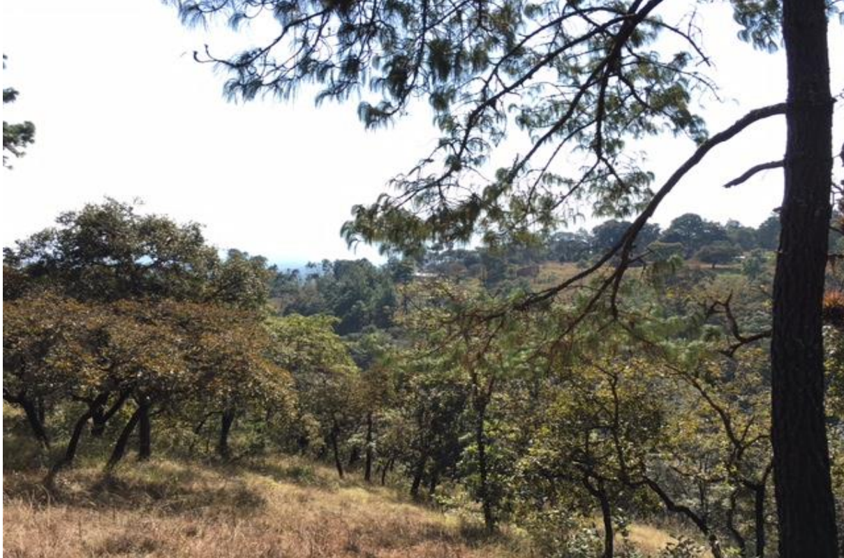
Figure 2: View from proposed trail

was valuable to focus on a starting point for an Eco-park rather than a fully developed park. We looked into what makes an Eco-park and what the foundation for an Eco-park should be composed of.