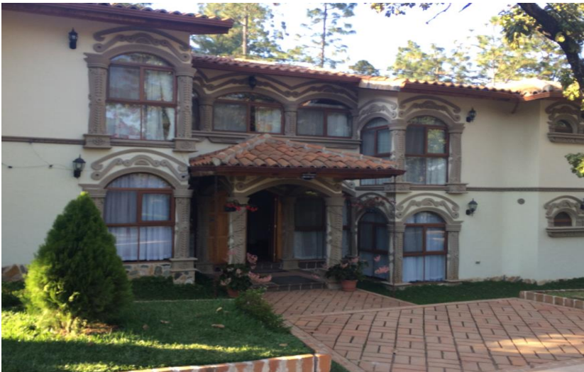
Figure 1: Front entrance to the Barbara Ford Peace Center Hotel