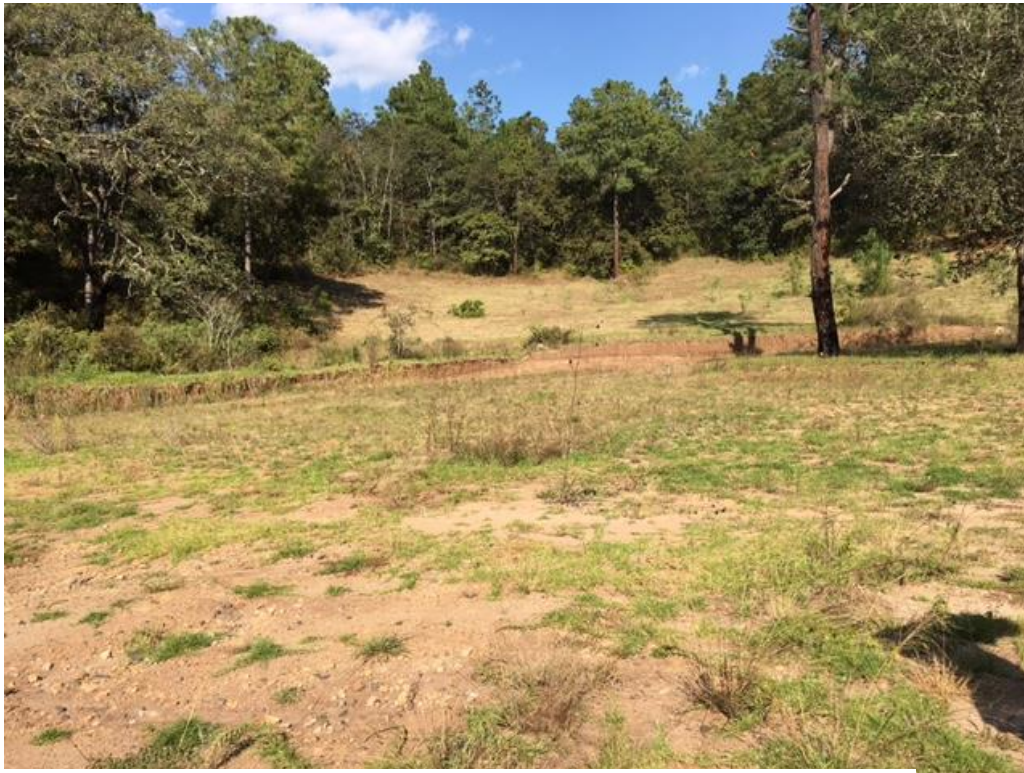
Figure 10: Trails will require more definition