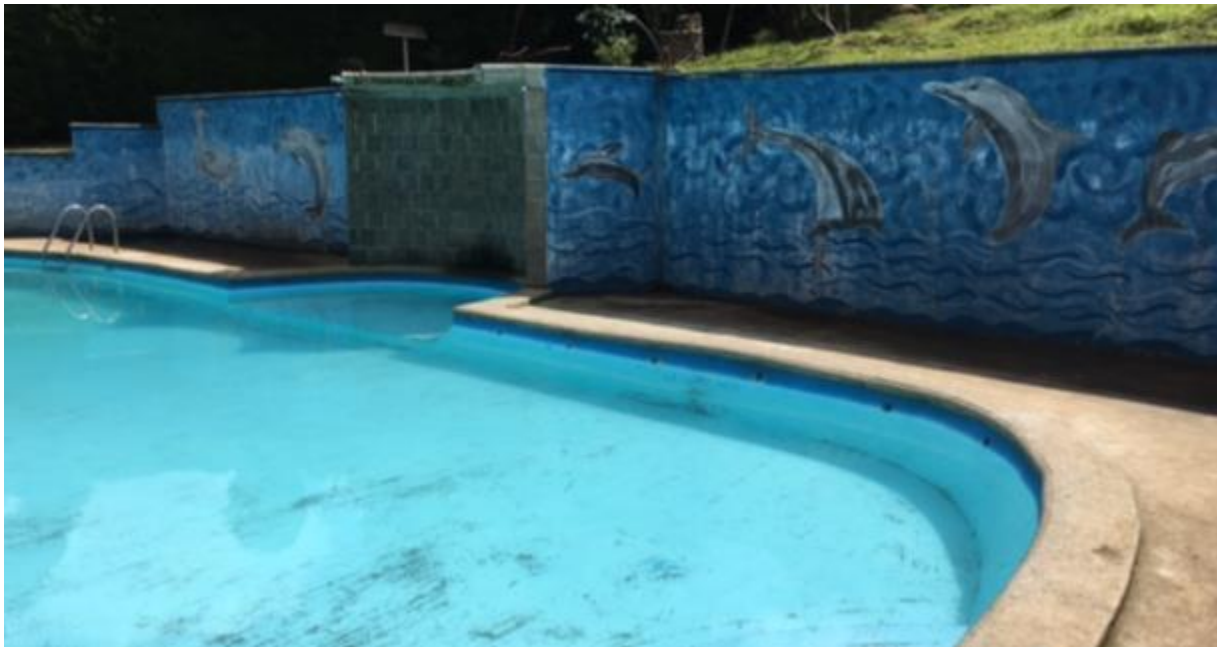
Figure 6: Swimming pool at Los Senderos del Abuelo

There were numerous teachers that said they had taken their students to an Eco-park before and were not very impressed with it. They would be willing to go back to one if it provided a more educational experience and was well kept. The educational aspect was especially important to them if it would incorporate science, such as the native species and plants in the area, or the history of the culture of the area. All of the groups agreed that this hands-on type of learning is something they would like to do on a field trip and be willing to spend money on.