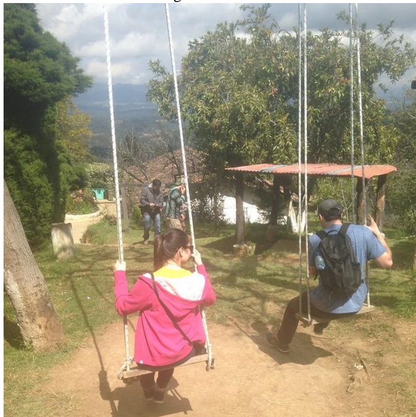
Figure 7: Swings at Los Senderos Park

We also noted the general lack of educational and informative material on the