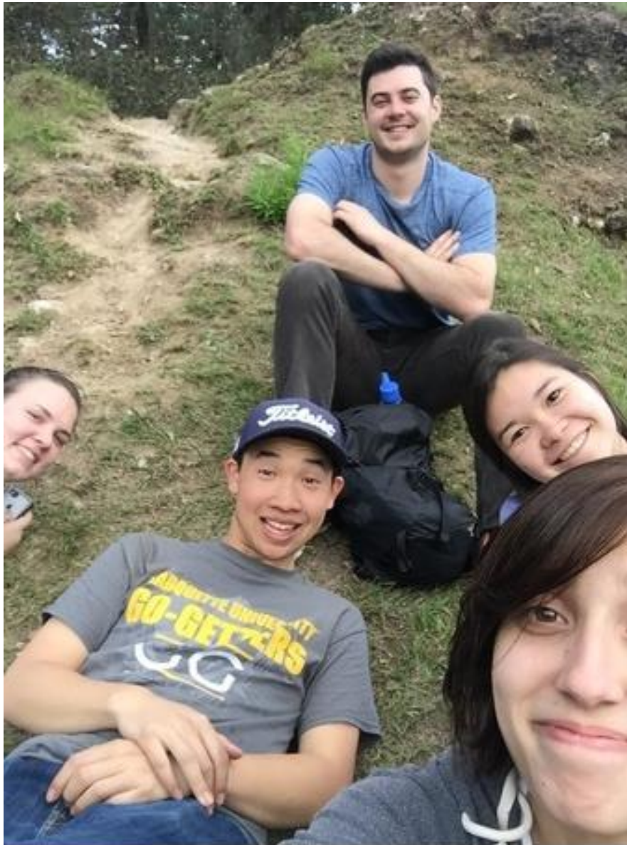
Figure 12: Marquette Students make their faculty proud.

"Los Senderos del Abuelo" website, accessed March 9, 2016. < https://1010experiencias.com/experiencia/las-mejores-distracciones-en-parque-ecologico-senderos-del-abuelo >.