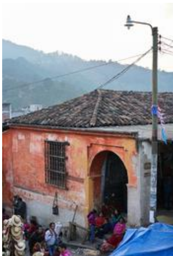
Figure 5: Community members gathering for the market in Chichicastenango

As mentioned earlier, we were able to interview individuals from four neighboring towns and/or schools, including Chinique, Panajxit, Chicabracan, and Santa Hermano Pedro. In this area of Quiché, there are a lot of subsistence farmers, which means they have much less