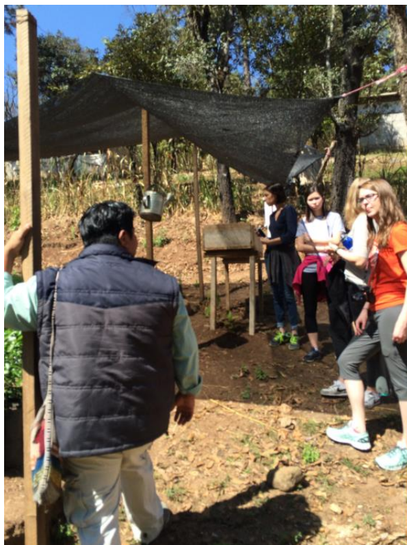
Figure 9: Learning about the model sustainable farm

work would require a team of himself and a few laborers in order to expand and define the trails since work on the trails requires hard physical labor.