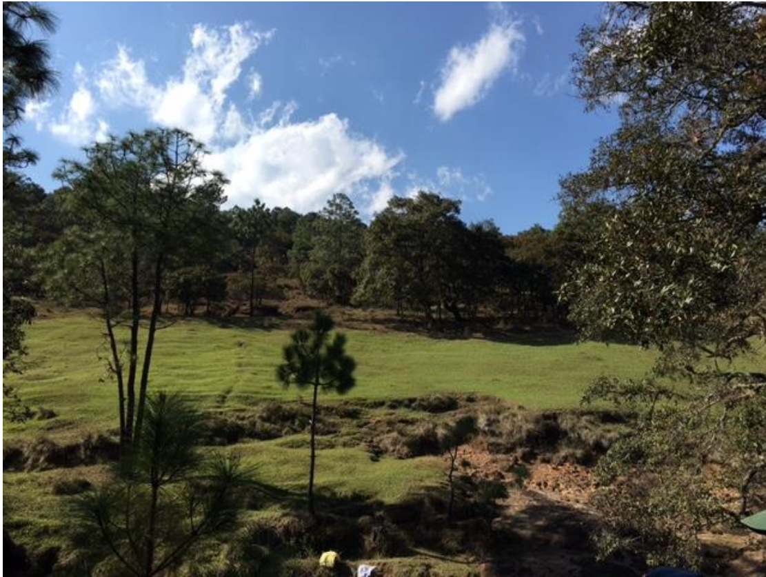
Figure 8: View of River bed from Trail

be intrigued enough by the current and potential attractions to come again. Through the implementation of a trail system, the BFPC could become a well-trafficked Eco-park.